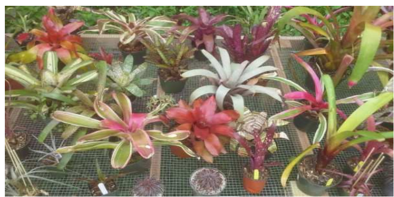
A few bromeliads