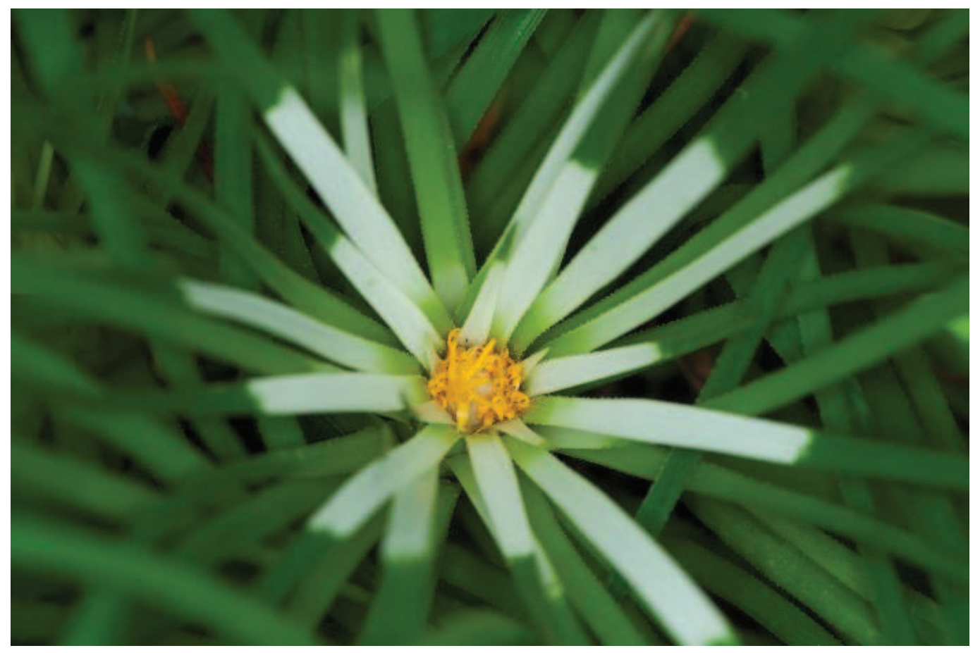
Navia lactea in bloom

Marie Selby has been among my top few botanical destinations (Kew Gardens in London, Kirstenbosch in South Africa and Desert Botanical Gardens in Phoenix round out the top four). After seeing the name again and again in orchid books and beside many amazing photos in Oliva-Esteva's Bromeliads , the allure had grown sufficiently to warrant a road trip.