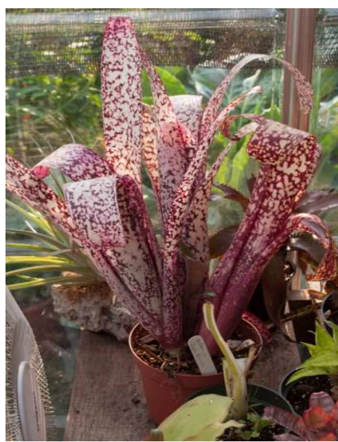
Billbergia 'Casa Blanca'