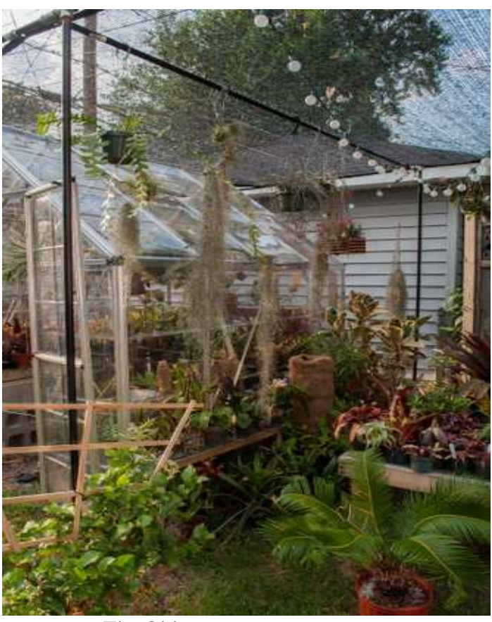
The Okla Greenhouse

Andrew and Malorie Okla, 2840 Parker St., Dearborn, MI 48124. Tele.: (248) 762-0896 will host our meeting in October: Discussion topic: Coping with Winter: What Instructions Does Natural Habitat Give Us? We are decidedly uncomfortable at 45° F. Which bromeliads feel the same way as we do? Do some need more water in the dry winter air? Or less in the cooler temperatures? The natural habitat offers valuable hints about the best ways to get our plants through the winter.