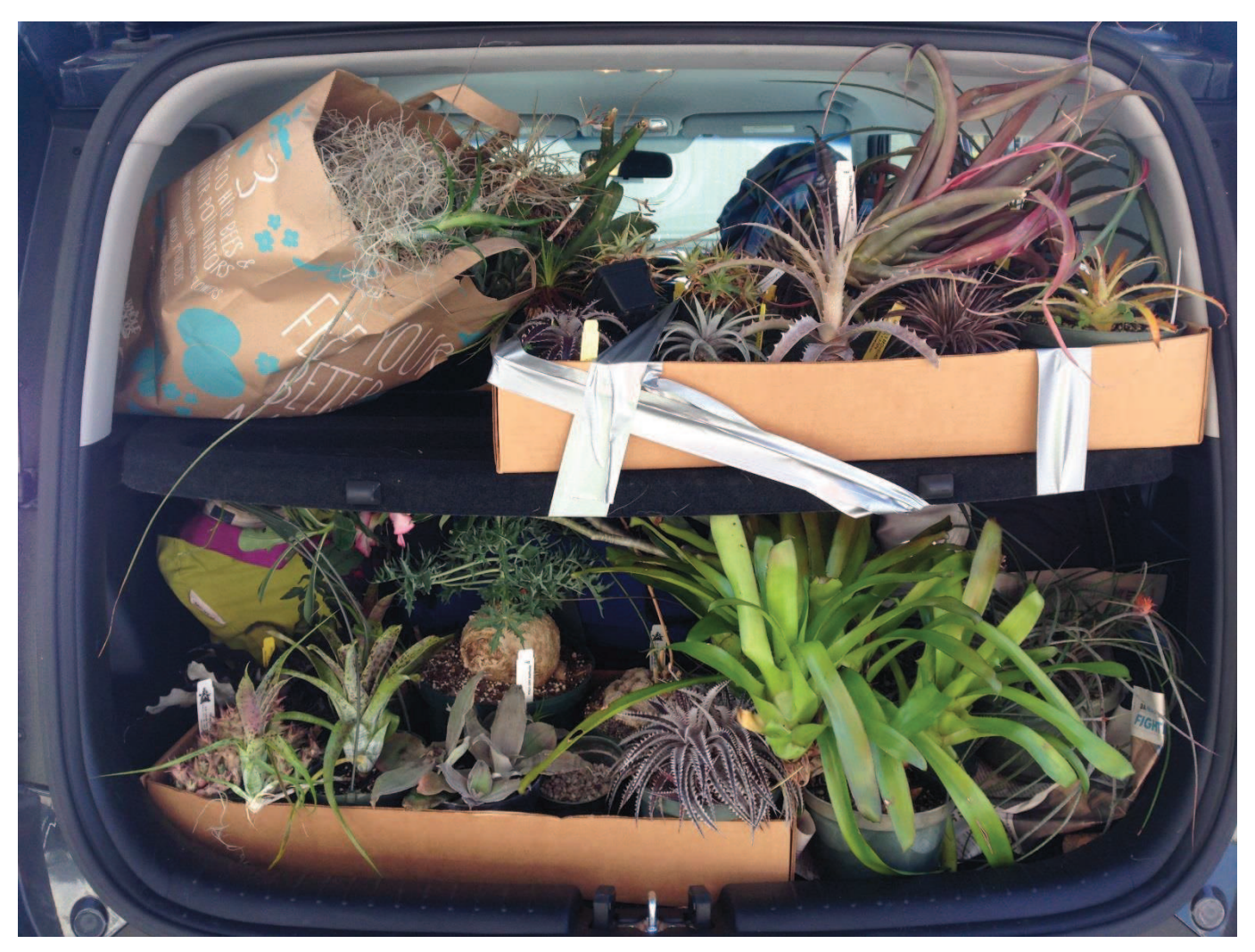
The finally lot. Not pictured is Wittrockia superba in the back seat

Addie even imparted a few plants that would join our collection or be sent to Matthaei (including a hefty chunk of T. funkiana ). When the view through our rear windshield was entirely obstructed, we tacitly agreed it was time to head home.