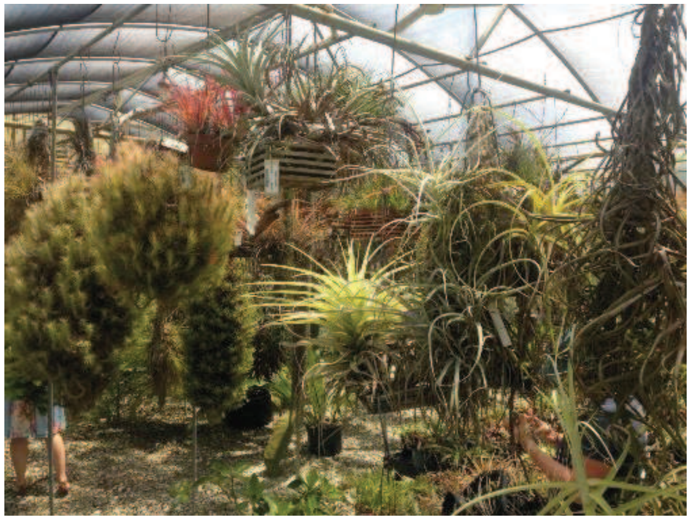
The 'Tillandsia house'

amorphophallus in flower, it offered a unique opportunity see some to bromeliads seldom encountered cultivation (e.g. Lindmania, Brochinnia, Fosterella, etc.). I was eager to finally see some Navia spp.in person, a rare opportunity for reasons made obvious by photos of the plants in situ: most reside in relatively isolated populations on the summits and steep cliff faces of Venezuelan tepuis, often in very specific microclimates that have made them thus difficult to adapt to cultivation.